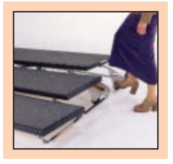
Gas-Spring Lift Assist