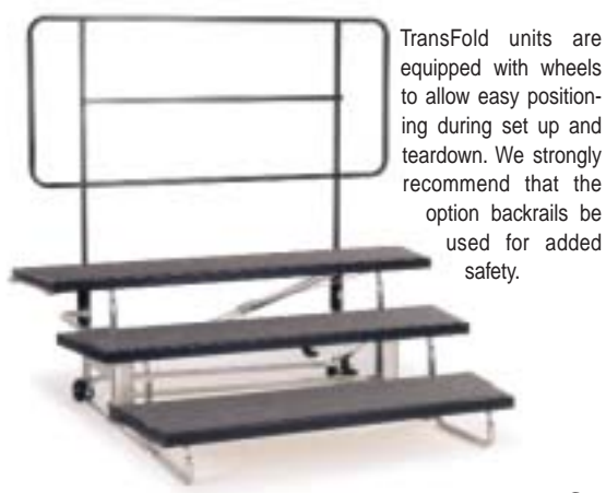
Model TFR72 Riser Unit with TFB72 Backrail