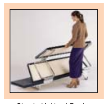
Simple Unitized Design